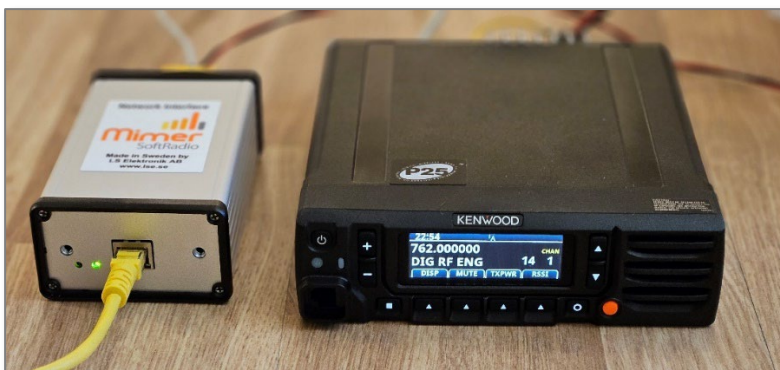
Network Interface connected to Johnson Viking radio

The network interface consumes max 0,3A.