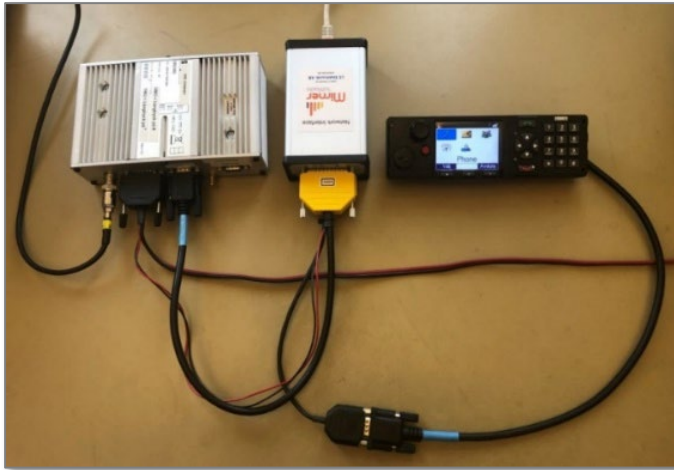
Sepura SRG with Network Interface and cable kit