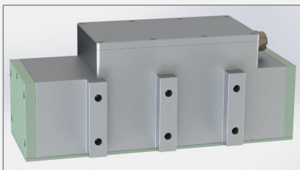
Train Antenna Unit

The Mimer Train Antenna is a purpose-built unit for communication between train and track, mounted underneath the train.