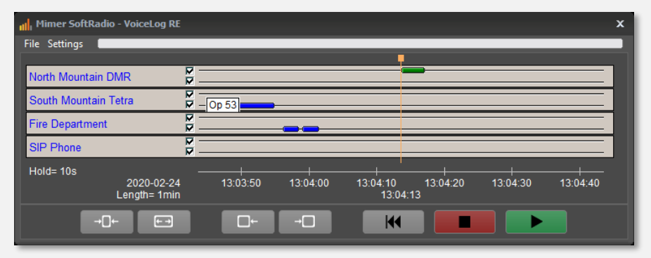
Operator window showing recordings

The VoiceLog software is delivered as a Windows Service for installation on a server or a PC.