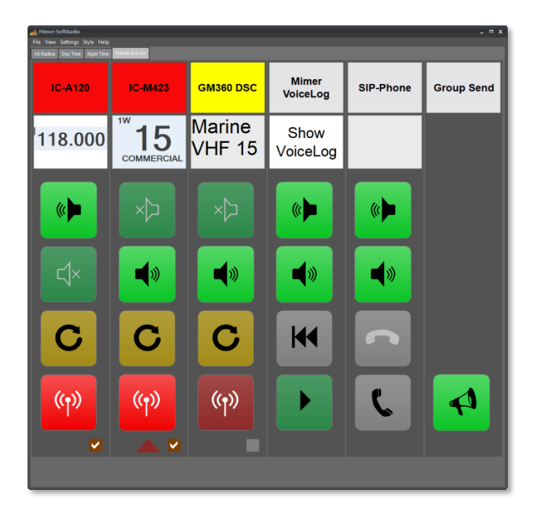
Example of SoftRadio operator GUI.

The purpose is to remotely control the two-way radio from the PC over a LAN, WAN or the Internet. In this way several operator PC's can share one radio and every operator can control several radios.