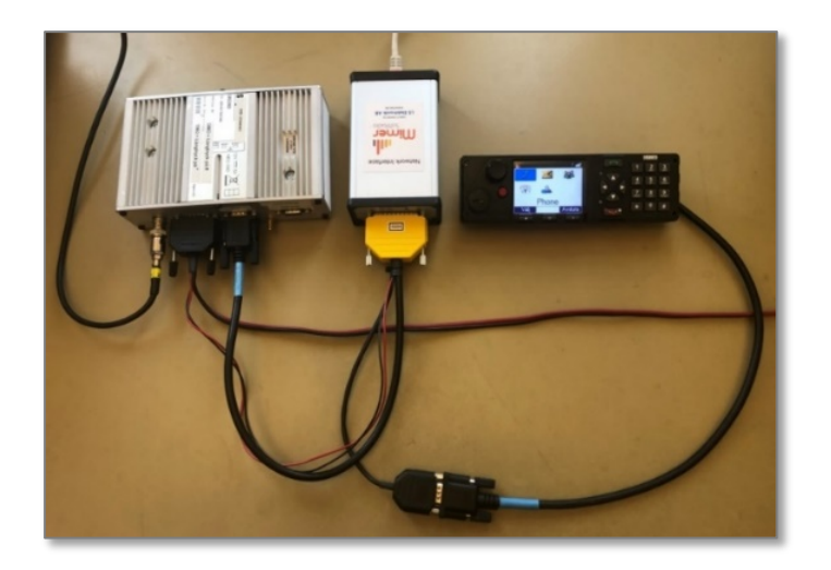
Sepura SRG with Network Interface and cable kit