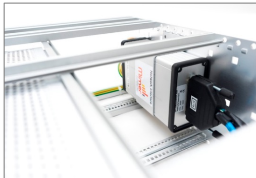
Interface mounting with bracket 3106