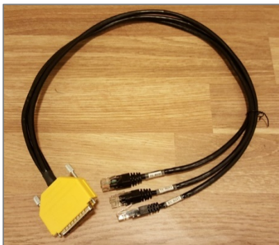
Cable Kit 3179

On some radios the Tx REM port is occupied with a cable from the PSU (REM2). You can then connect the cable marked Tx REM to the PSU (REM1) instead.