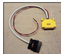
Cable Kit MTM5400

The network interface consumes max 0,3A.