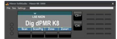
Virtual Control Head

It will also give a Virtual Control Head with a limited set off functions. Please see webpage for details.