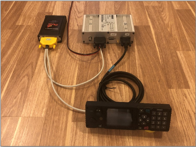
Fully connected kit