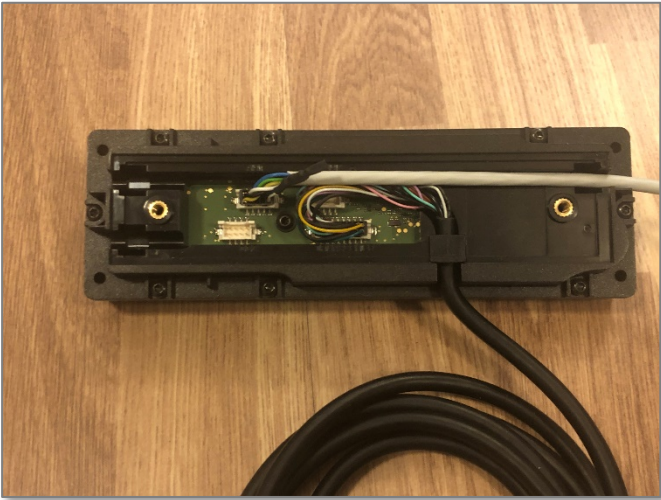
Connection at the back of the control head