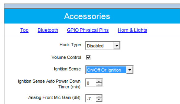
Setting for Ignition Sense