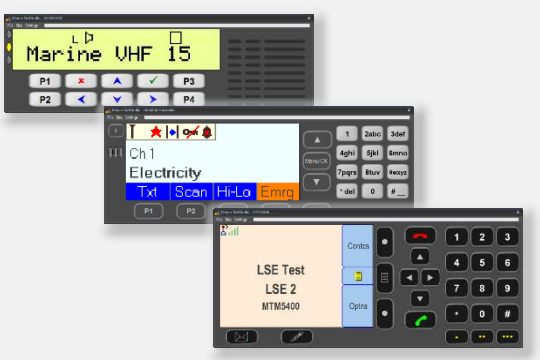
Virtual Control Heads

The system allows for mixing of radio types at the same operator, so that analogue radios (e.g. Marine and Airband) and digital radios (e.g. DMR and Tetra) can be controlled.