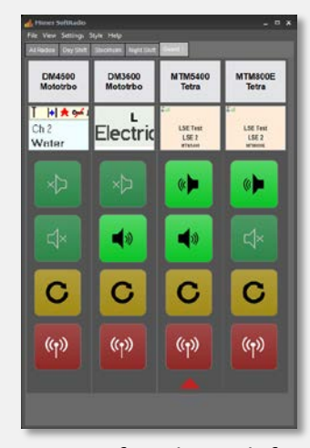
Mimer SoftRadio with four Motorola radios connected

Optionally all audio can be recorded and calls can be cross patched between radio systems. Also phones and intercoms can be operated from the same PC.