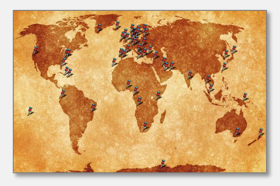
Mimer SoftRadio is used in over 50 countries around the globe. At the moment available in ten languages.