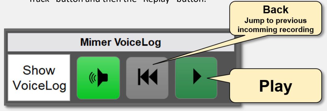
Part of SoftRadio main window

You can listen to the last incoming message by clicking the "Back Track" button and then the "Replay" button.