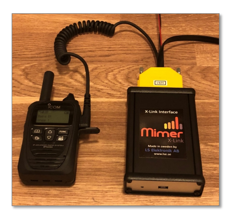
Cable kit X-Link to Icom portable

The volume of the portable shall be set to "half" volume.